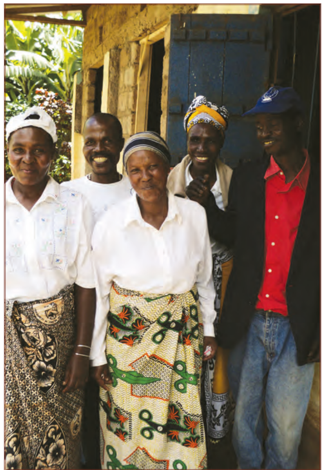
Some of the members of the Kiwavukame Support Group.

As part of the empowerment strategy, Maisha Kikamilifu focuses on harnessing the potential of PLWHA as ambassadors of hope for positive living, through training in appropriate skills including public speaking and disclosure of status. It also supports participation of PLWHA in events such as the World AIDS Day, community sensitisation activities and other AIDS related events. However, full empowerment and positive living cannot be attained without reliable sources of income. Thus, the project facilitates formation of support groups of PLWHA and establishment of income generating activities as a way